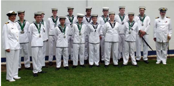
TS Centaur Staff and Cadets at the Annual Presentation Parade 2016.